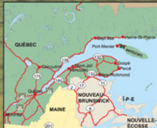
Conception graphique: 360.com, dessin: Guy Gagnier 360.com