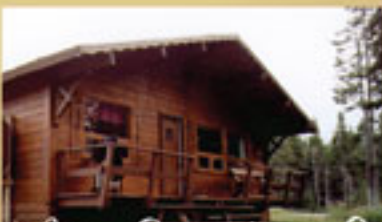
Lac Geneviève Cabins